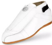
Riedell Model 395