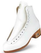
Riedell Model 297