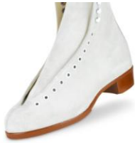
Riedell Model 135

Select the boot model that you wish to ColorLab.