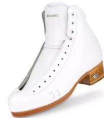
Riedell Model 3200