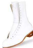
Riedell Model 172