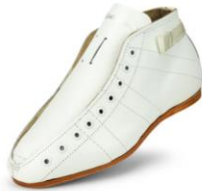
Riedell Model 595