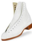
Riedell Model 135