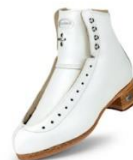
Riedell Model 336