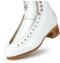
Riedell Model 336