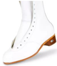
Riedell Model 172