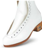
Riedell Model 297