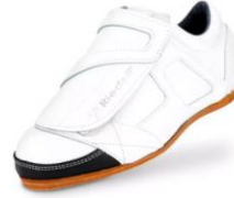
Riedell Model 951